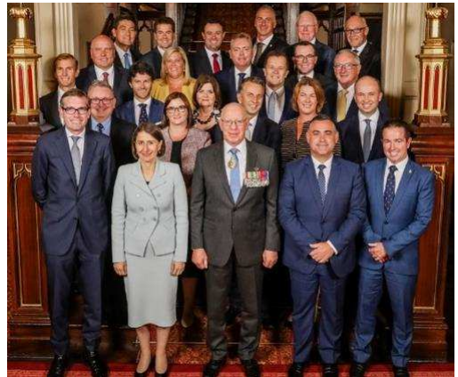
NSW Cabinet

We look forward to working closely with them in their policy areas over the next term.