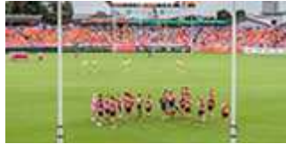
SYDNEY SHOWGROUND KICKS OFF THE AFL SEASON BY INTRODUCING REUSABLE BEER-CUPS