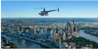
BIGGER, BETTER ROTORTECH 2020 FOR BRISBANE