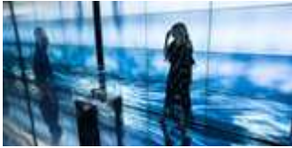
OUR TOP 5 MUST HAVES TO ENHANCE YOUR LIVE BRAND EXPERIENCE