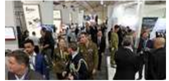
AVALON 2019 BREAKS TRADE DAY RECORDS