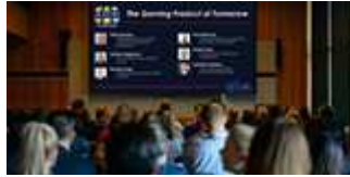
THE AUSTRALASIAN GAMING EXPO IS EXPANDING ITS SEMINAR PROGRAM FOR 2019