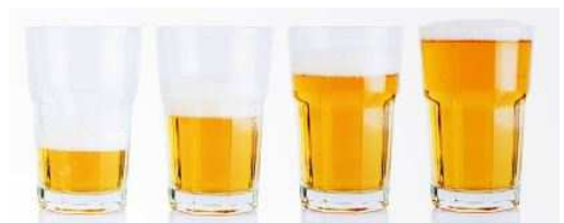
Top up your qualifications at TAFE NSW

These new regulations will affect NSW venue Members. EEAA partner, TAFE NSW is offering these training programs face to face or online.