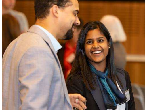
Evenire Thursdays - a new-style event of the Young Stars Committee starting on May 9.