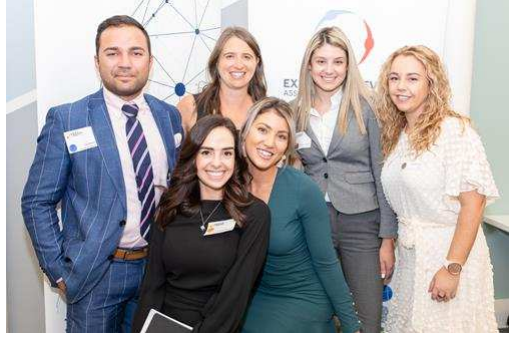
Organiser, Supplier and Venue Members at the EEAA YS Meet-up, 9 May, Sydney

The last Sydney YS Meet-up sold out so stay tuned for further details on speakers and save the date in your diaries.