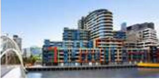
WATERFRONT MELBOURNE APARTMENTS YOUR HOME AWAY FROM HOME