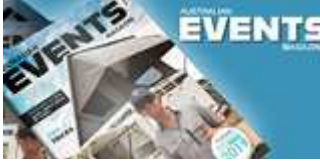
THE AUSTRALIAN EVENTS MAGAZINE